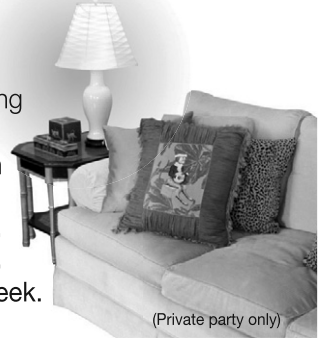
(Private party only)

The Greenville Advocate, The Luverne Journal, The Butler County News, The Lowndes Signal and The Butler Express.